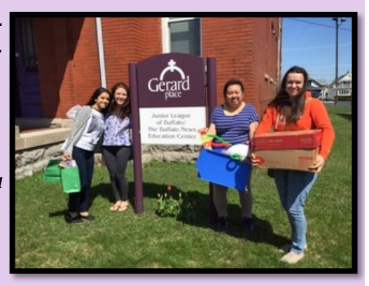
<u>RIGHT</u>: A toy drive for a local women and children's housing facility was a spring semester highlight for CEC.

<u>LEFT</u>: CEC students participate in a professional development session on general education classroom co-teaching.