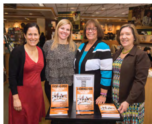
"Doing PDS" Book Signing at Barnes and Noble