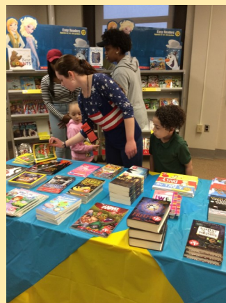
EXE 100 students help students from BPS #33 choose the right book!